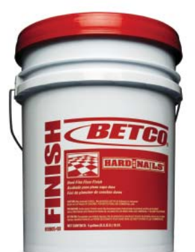
AVAILABLE IN: 65904-00 CS./4-1 Gal. 65905-00 Pail/5 Gal 65955-00 Drum/55 Gal 65959-00 QuickCoat-CS./2-1.25 Gal